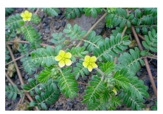
Puncture Vine

As of 2013, approximately 338 species of exotic aquatic and terrestrial plants infest lands in the State of Utah. Currently, Utah has declared 54 of these species as noxious weeds.