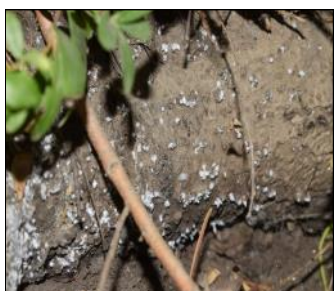
BWA white woolly masses on Subalpine fir trunk

In September 2017, balsam woolly adelgid (BWA) was confirmed in Utah. It has now been confirmed in Box Elder, Cache, Rich, Weber, Davis, Morgan, Salt Lake and Summit counties, with more counties likely added to the list in 2018.