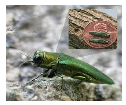
Emerald ash borer

EAB was first detected in Michigan. It is thought to have been in wood packing material, imported from its native Asia. Since then, EAB has been found in more than 20 mid-western and eastern states, killing more than 50 million ash trees.