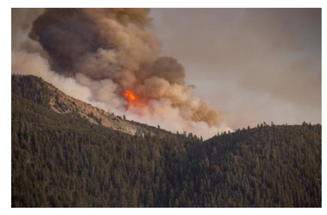
Brian head fire smoke column

Large fire consequences include; sterilization of soils when fires burn hot, spread of invasive weed species and potential loss of high elevation tree components, such as subalpine fir and Engelmann Spruce which may take a few hundred years to restore to mature Engelmann spruce stands.