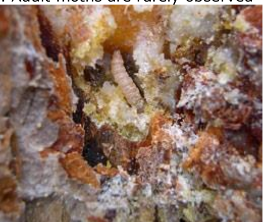
Figure 2: Pitch mass removed exposing larvae.

Control: The best way to prevent or reduce pitch mass borer attacks on susceptible trees, is to keep them healthy