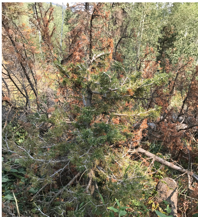
Figure 6. Young subalpine fir infested with balsam woolly adelgid; note severely stunted growth.

farms and in urban settings. Including other management techniques, such as planting non-host trees, can prove useful since chemical treatments would be indefinite, costly, and ongoing.