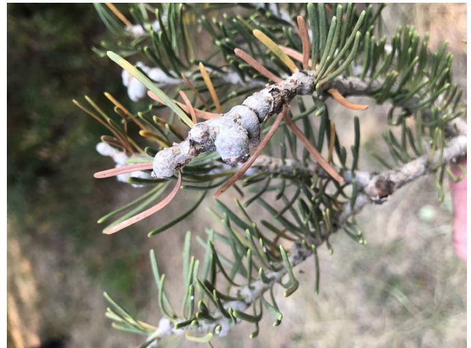
Figure 3. Abnormal swelling, or gouting, of fir branches caused by feeding injury from the balsam woolly adelgid.

In its native range, BWA alternates between spruce and fir; however, in North America, BWA remains on fir as its European spruce host is not present. BWA populations in