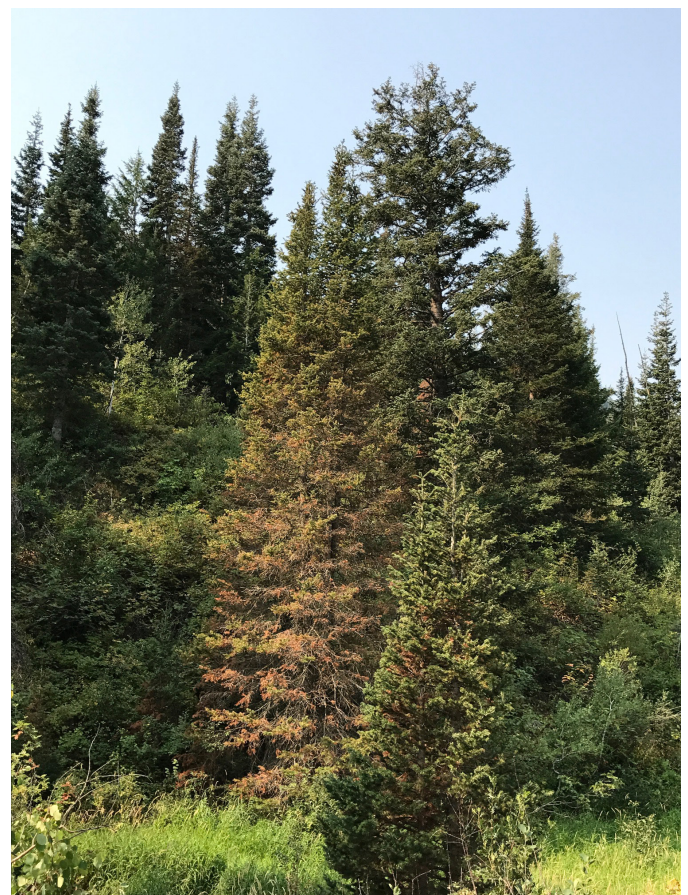
Figure 4. Subalpine fir tree canopy decline; note dying lower branches and green top leader.

North America are composed of females reproducing without mating (parthenogenesis); sexual reproduction requires the European spruce host.