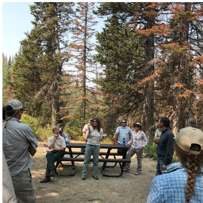
Figure 7. Utah partnership of interested agencies and stakeholders attended a tour of balsam woolly adelgid damaged sites in Farmington Canyon, September, 2017.

A Utah partnership has been formed to implement survey, research, education and management efforts for BWA. Led by the Utah Department of Agriculture and Food, members represent concerned organizations including the United States Department of Agriculture (USDA) Forest Service; the Utah Division of Forestry, Fire and State Lands; Utah State University Extension; USDA Animal and Plant Health Inspection Service; and ski resorts (Fig. 7). This group is coordinating efforts to secure grant funding to study BWA and its impact in Utah, and to develop public educational resources.