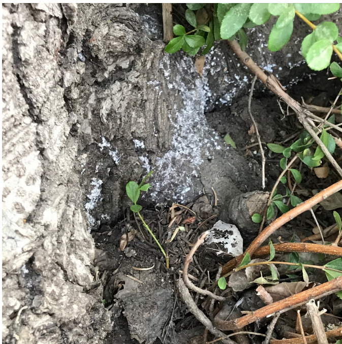
Figure 2. White woolly masses of balsam woolly adelgid on a fir trunk collar.

Stem or bole infestations tend to be more serious than crown infestations, and can result in wide, irregular growth rings and reddish, brittle wood called “rotholz”. Host responses to BWA feeding eventually cause decreased water flow to the crown, leading to tree death. Tree mortality typically occurs within 2-10 years of infestation; heavy infestations can kill trees in 2-3 years.