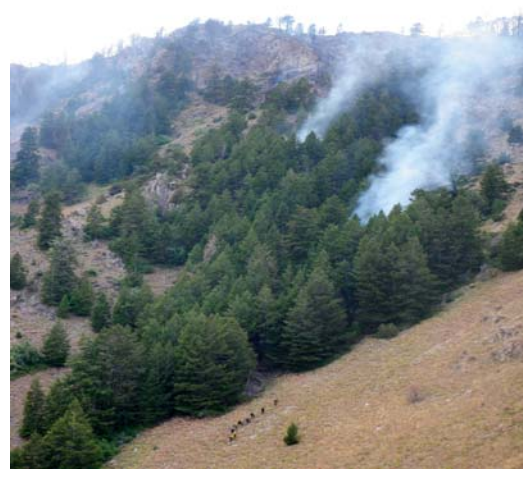
everyone mentally & physically 8/26/08 – 10/22/09

Soon after the Big Pole fire the crew lost two student-employees who returned back to school. This loss allowed opportunities for crew members from the Dromedary Peaks fuels module to move on to the UFRA crew.