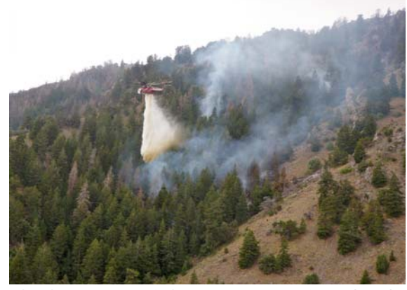
The later part of the season continued to be steady with small fires and project work. The UFRA crew was able to go to Wyoming and help with a type 4 incident, and finished the fire season in Zion National Park on a type 3 incident.

Soon after the Big Pole fire the crew lost two student-employees who returned back to school. This loss allowed opportunities for crew members from the Dromedary Peaks fuels module to move on to the UFRA crew.