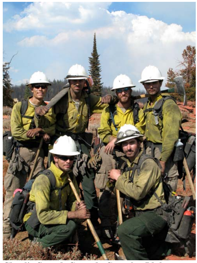
Charlie Squad, Cascade Complex Idaho.

The 2007 season was busy and long. The following chart shows an at a glance comparison of the 2006 and 2007 seasons. Note that in 2007 the UFRA crew stayed intact and available much longer than historically, this was due to student interest in extending past the August 13<sup>th</sup> semester. This enabled UFRA to travel to Southern California for fires in late October.